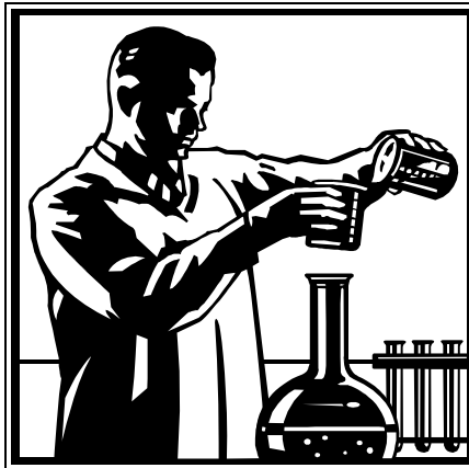
NutriLab makes "CutsomVite," a custom-compounded nutritional supplement regimen for each individual patient.

Maximum bioavailability is achieved by delivering appropriate concentrations of nutrients at the cell level.