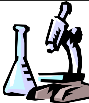
Lab Testing helps to make nutritional prescribing more accurate

This is the way of the future! Why? Because with Custom-Vite you are getting the preventive medicine you need to optimize your health without either you or your physician